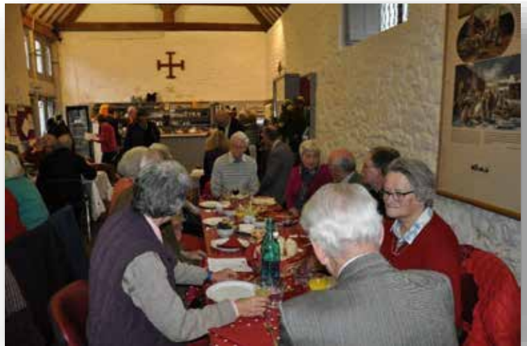
Right: Friends enjoying a Winter Lunch in the Hundred Mens' Hall