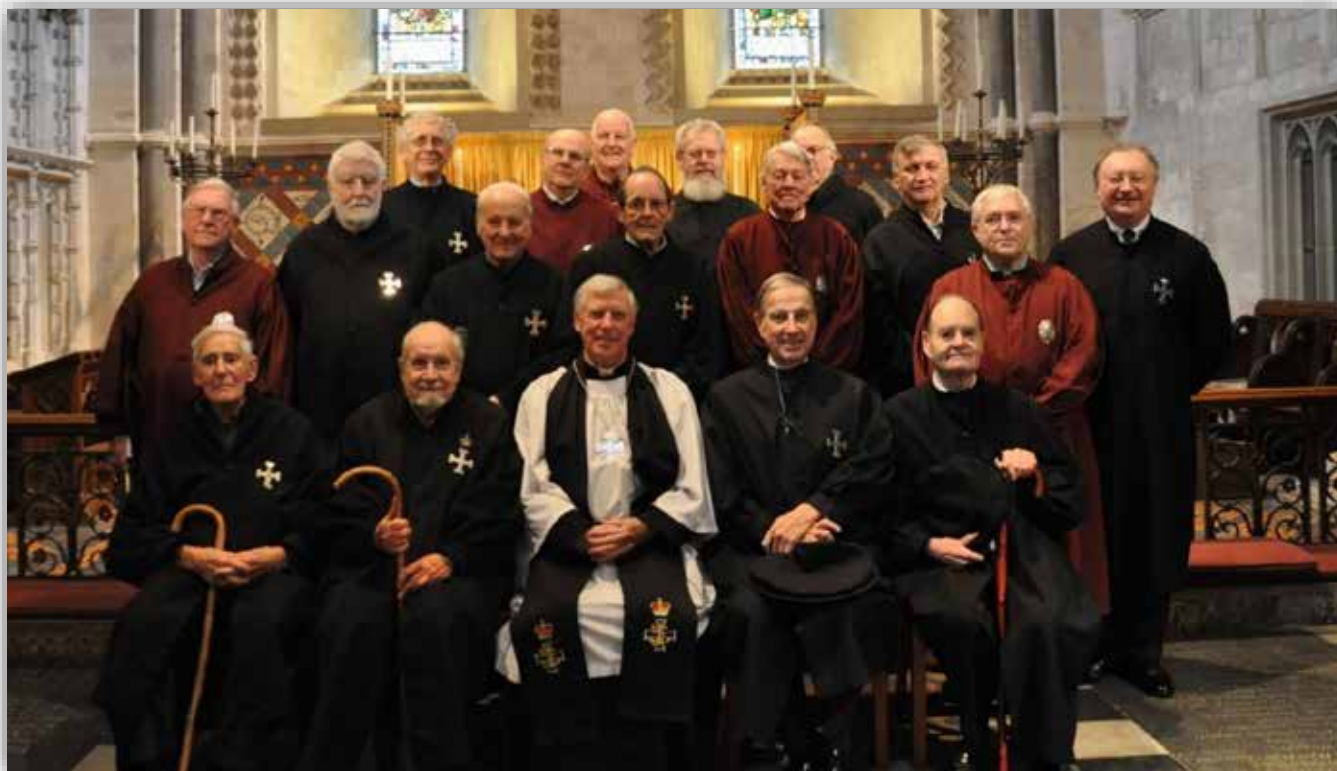
The Master and some Brothers in St Cross Church