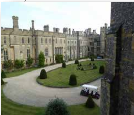
Arundel Castle, seat of the Duke of Norfolk