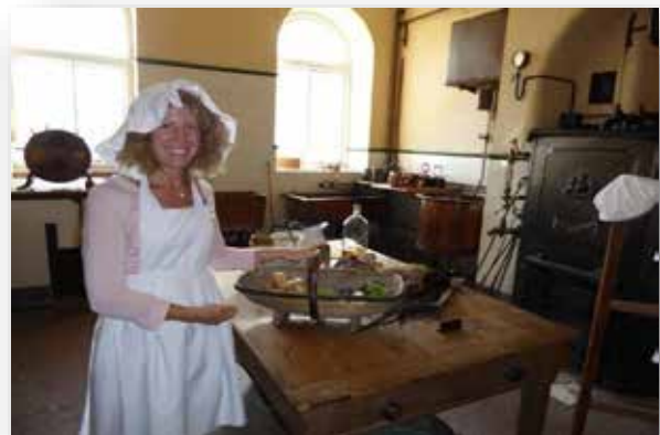
Our Administrator at Petworth House