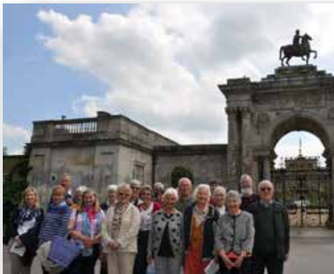
Friends outside Wilton House, home of the Earl of Pembroke

The Friends enjoyed several outings during the year. Below are a few photographs from some of these visits.