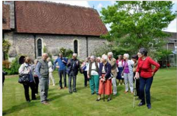
Friends at the Hospital of St Nicholas, Salisbury