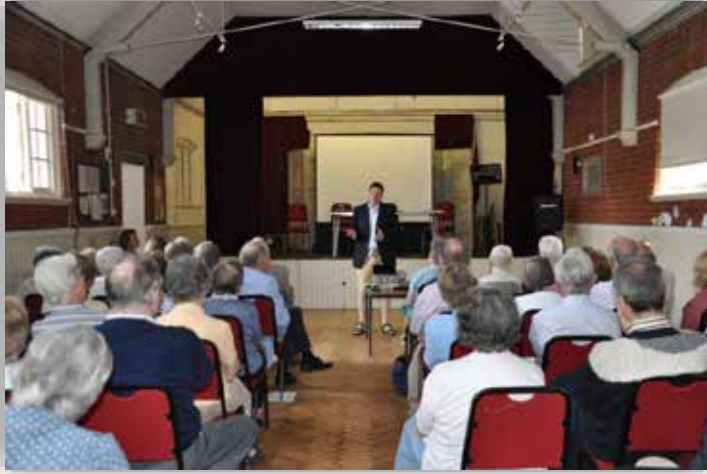
Steve Brine MP addressing the Friends in the Parish Hall